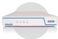
IP PBX T100S(1PCS)

Thank you for purchasing ZYCOO IP phone system. These are the items included with your IP phone system purchase: