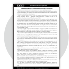
Warranty Card (1PCS)